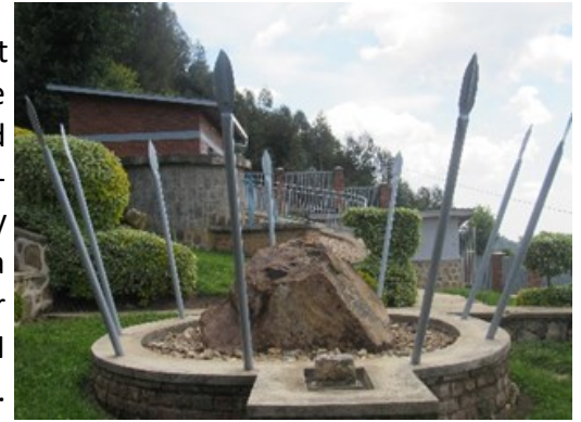
Spears to represent the resistance at Bisesero Memorial

Most of the locations we visited and folks we met with were not new to me but there are always new things to learn. That was the case when we visited a memorial site near Lake Kivu. We had planned to go to the site in Kibuye, by the lake, but it is under renovation and so the vice mayor of Kibuye took us an hour's drive away to another site. I had not been there before, and as a leader was a bit uncomfortable going to the unknown but was willing to trust our Rwandan host. It proved to be one of the most significant sites I have visited. Bisesero is high in the mountains on a rough dirt road. It commemorates the resistance of some 40,000 Tutsi who fought against the Interahamwe militia for over a month in May 1994, using spears and stones to hold off the killers. Only 1,500 survived to continue hiding in the hills until the genocide ended on July 4, 1994.